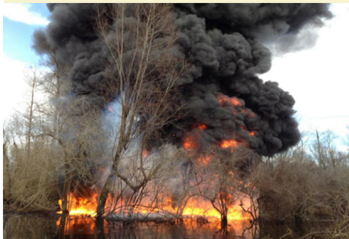
FIGURE 5. Plume observation from a peat bog in-situ burn (EPA 2002)