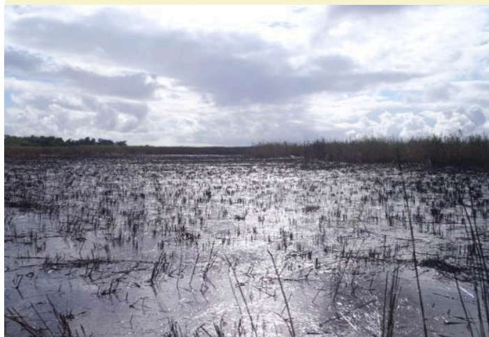
FIGURE 4. Burn residue clean-up after an in-situ burn in a peat bog (EPA 2002).